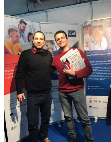
Career Counselor of the Ministry of Education and Culture