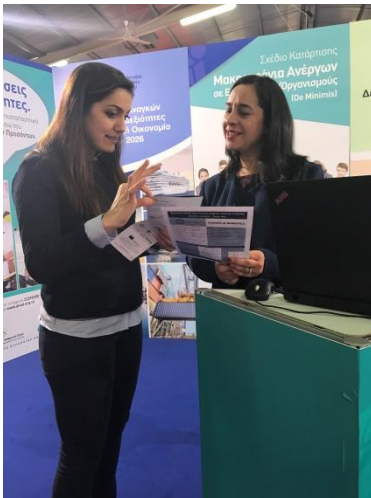
Representative of the Human Resource Development Authority