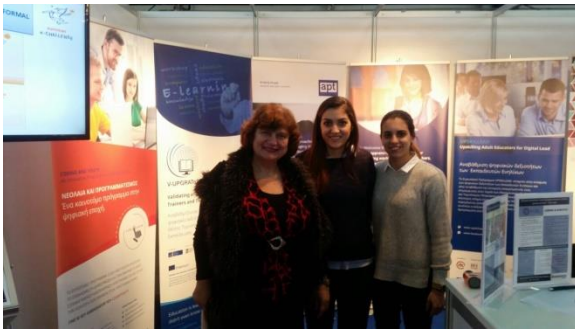
Permanent Secretary of Ministry of Education and Culture