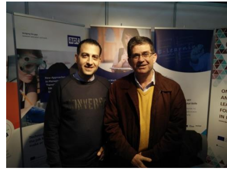
Member of Parliament